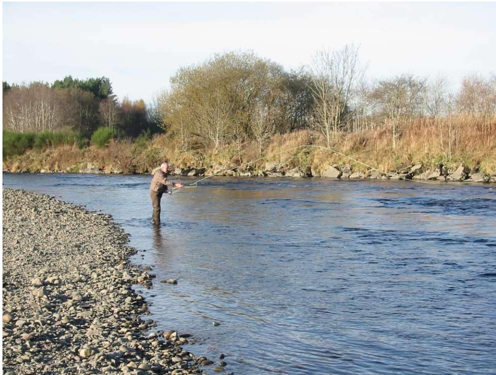
River Nith, Rosehill