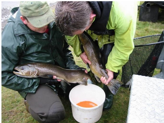
Sea trout being stripped