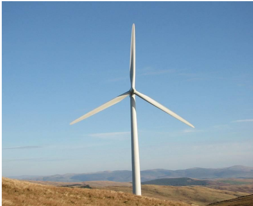
Wether Hill Windfarm

NDSFB is consulted by proposers of windfarms in the River Nith catchment. These developments can be potentially detrimental to the environment in which fish live. The Board has conducted baseline surveys and mitigation work in relation to Wether Hill windfarm, Whiteside windfarm and Kyle windfarm.