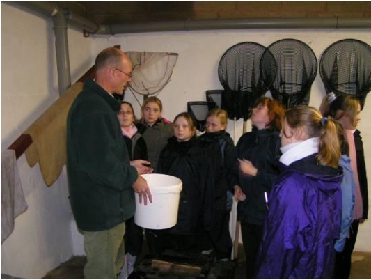
Sanquhar academy pupils

The Board uses its hatchery facilities to provide public education about fish, fisheries management and the socio-economic impact of salmon to the River Nith Catchment. Public visits are arranged by appointment and visitors are given an insight into the life cycle of salmon and sea trout. The Board considers this an important aspect of its work which raises the profile of salmon and sea trout and heightens public awareness about the Board's activities. The Board has been successful in obtaining sponsorship to support the costs for specific school visits to the hatchery.