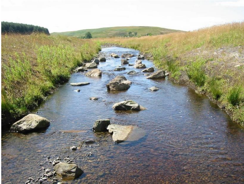
Establishing habitat at House of Water